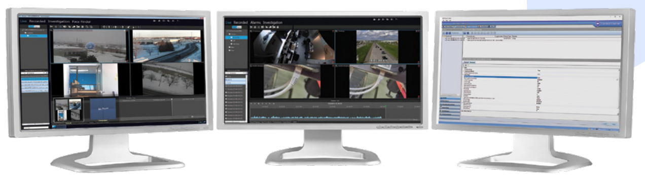
Comprehensive video monitoring, management and health awareness.